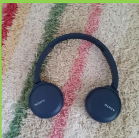
I listen TKKG.