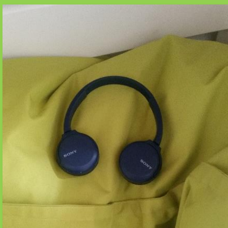
I listen TKKG again.