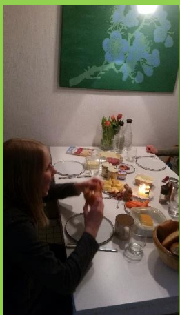
I have breakfast in the morning.