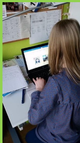
Then I do Homework.